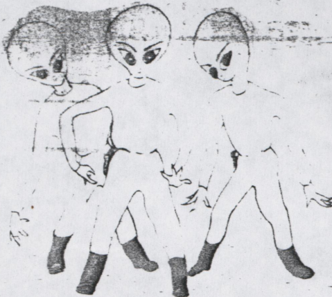
ALIENS ABOUT THREE FEET TALL and dressed in silver suits is how most abductees describe the creatures flying the UFOs. There are also accounts of more human-like aliens standing five feet tall and less frequent accounts of giant aliens as tall as eight feet.